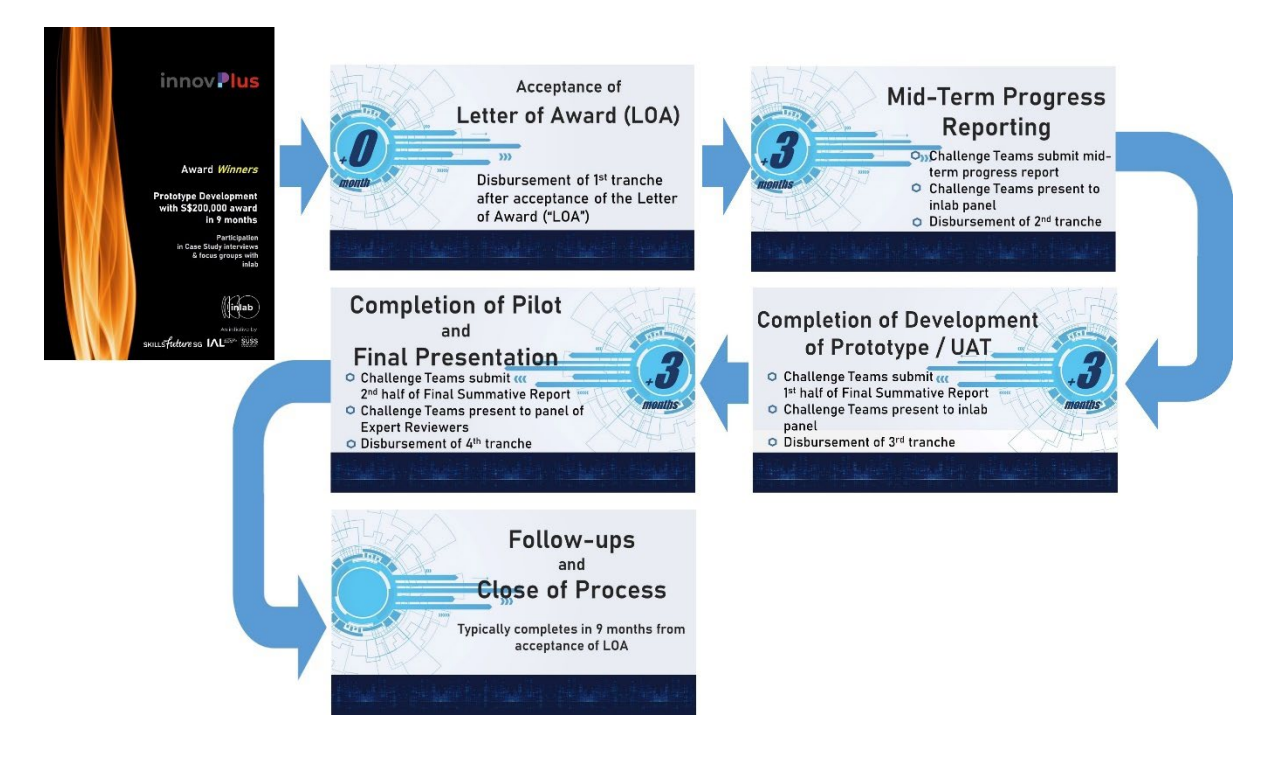
Diagram 2 - innovPlus Prototyping and Pilot Testing Phase Process Flow

10. Depending on the prevailing implementation challenges and needs, innovPlus Secretariat reserves the right to amend and change the processes with approval from Director of Innovation Centre, that complies with the intent and spirit of innovPlus.