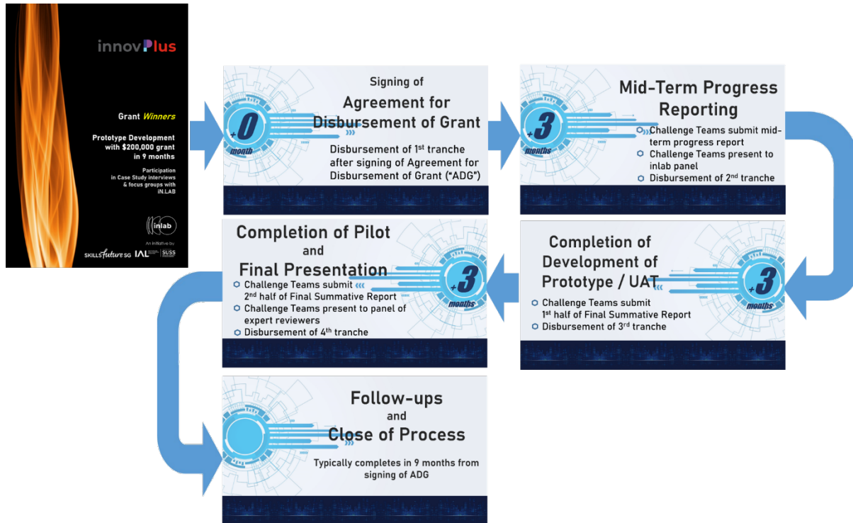
Diagram 2 - innovPlus Prototyping and Pilot Testing Phase Process Flow